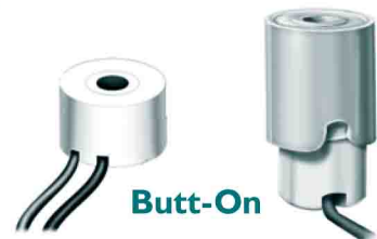
Catalog # 05-1320A Stationary & Spring-Loaded Set Illustrated