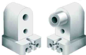
Catalog # 05-1319 Stationary & Spring-Loaded Set Illustrated